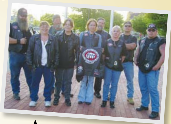
▲ BACA - Bikers Against Child Abuse