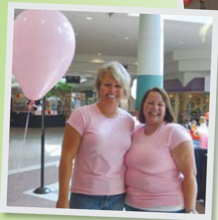
▲ Flamingos, Day at the Mall