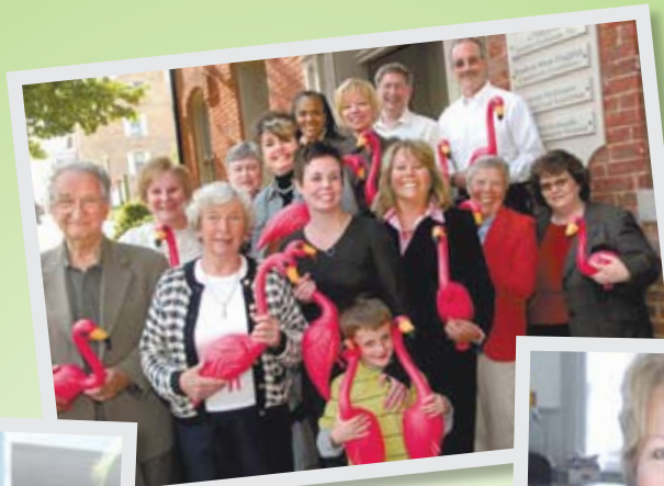
▲ Flamingos, Board of Directors