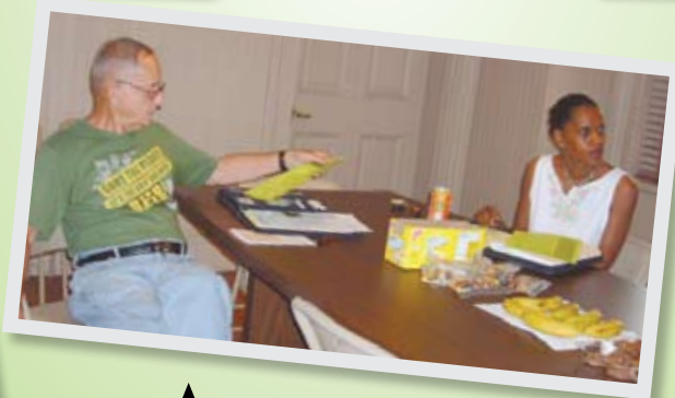
▲ In Service Training