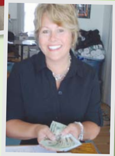
▲ Flamingos Pay Off!